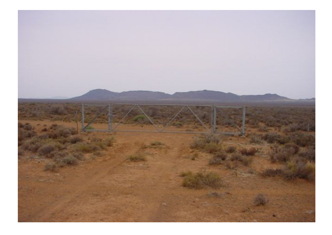
Figure 3: Standard Eskom gate as was used on the Hydra- Droërivier No 3 Line.

This gate is installed during the construction of a new line.