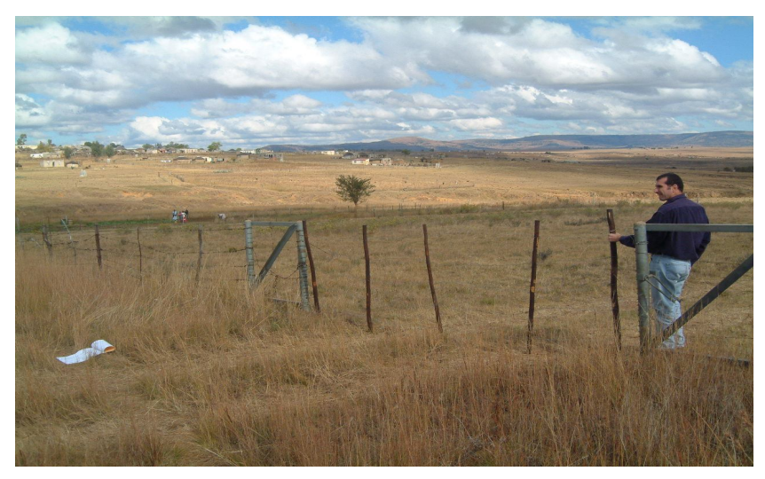
Figure 5: An example of a "concertina gate" that is being used as a servitude gate. Also note quality of fencing used adjacent to the gate.

In areas where the theft of gates is particularly prevalent, use can be made of concertina gates. These gates are very cheap to manufacture and experience has shown that they are not affected by theft.